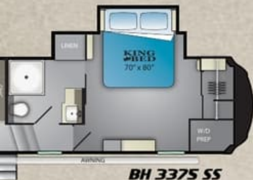
BH 3375 SS