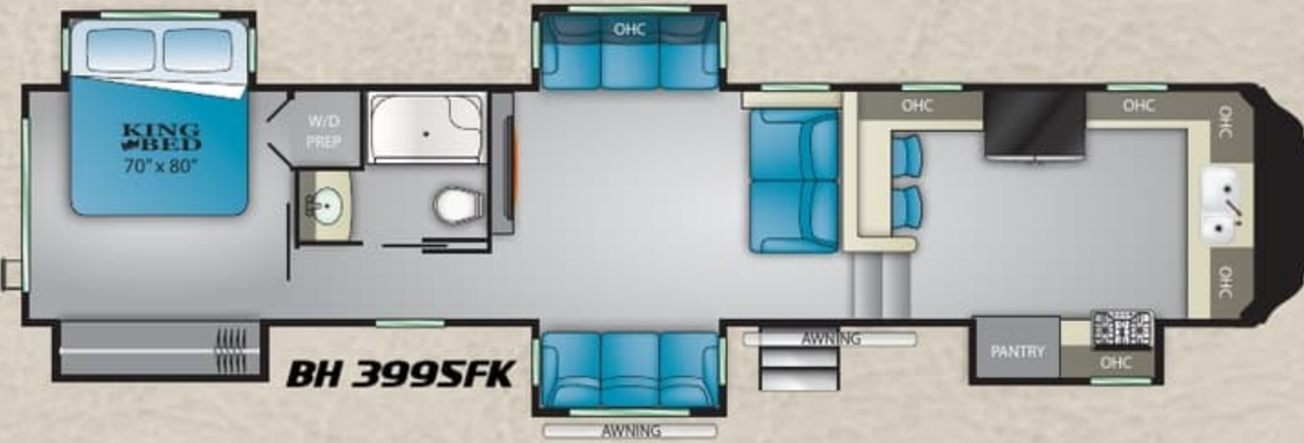
BH 3995 FK