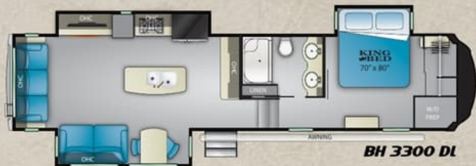
BH 3300 DL