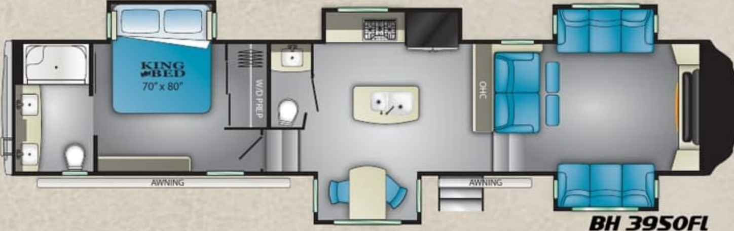
BH 3950 FL