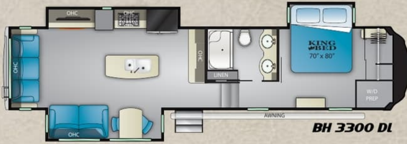
BH 3300 DL