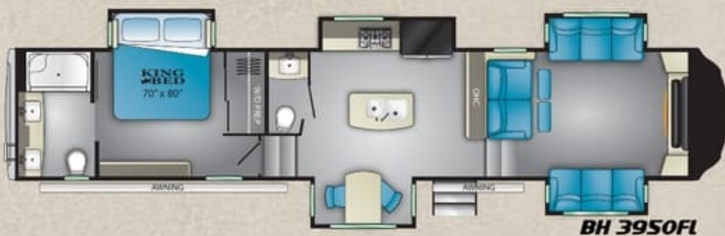
BH 3950 FL