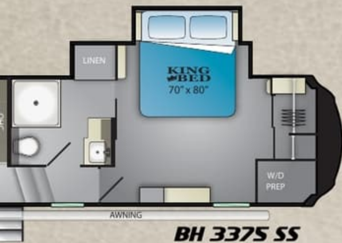
BH 3375 SS