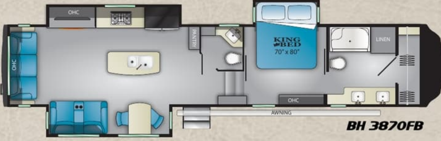
BH 3870 FB