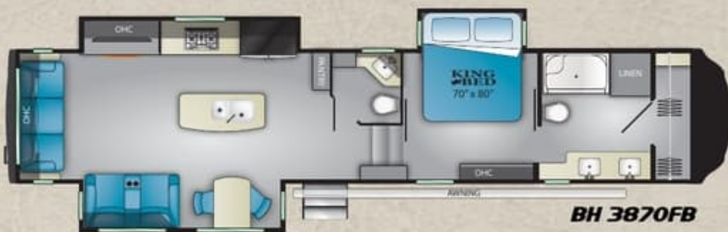
BH 3870 FB