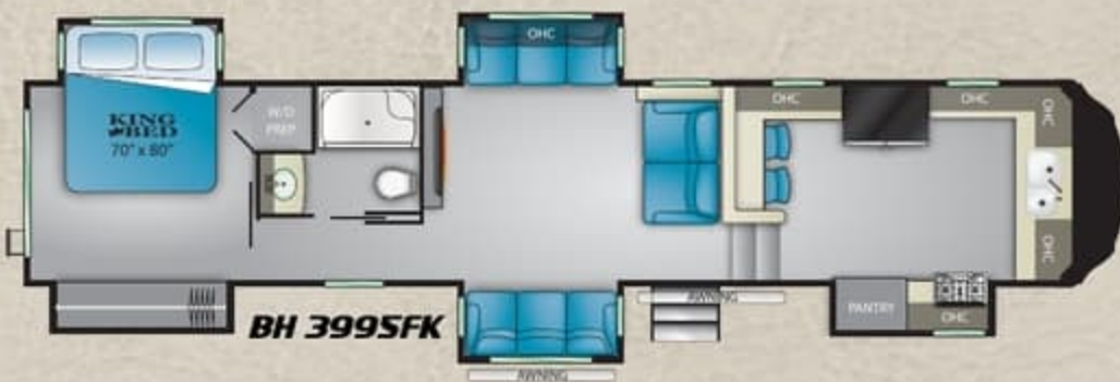
BH 3995 FK