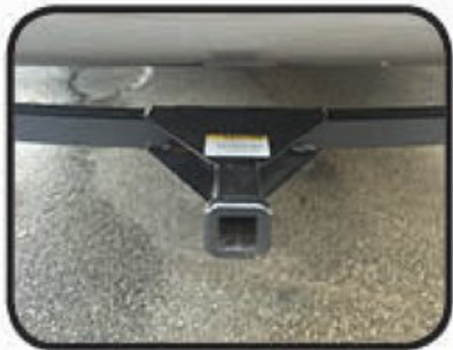
REAR ACCESSORY HITCH