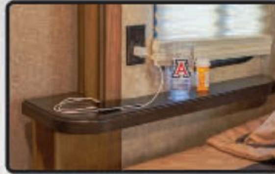
WRAP AROUND HARDWOOD NIGHT STANDS W/OUTLETS AND CUBBY STORAGE