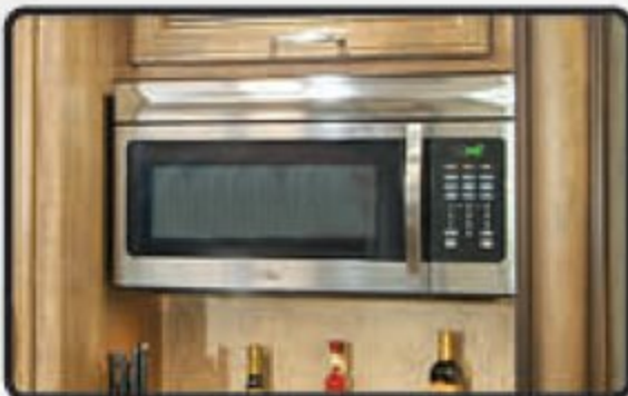
30" RESIDENTIAL CONVECTION MICROWAVE