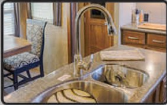
70/30 SINK W/PULL OUT FAUCET W/SOLID SURFACE SINK COVERS