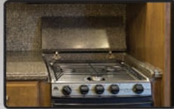
SOLID SURFACE HINGED RANGE COVER