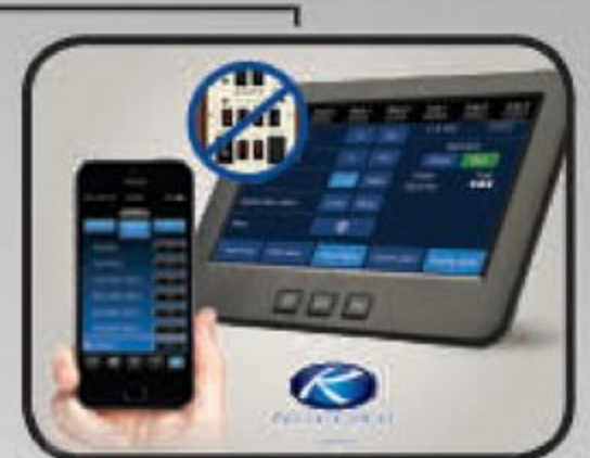
IN-COMMAND CONTROL SYSTEMS