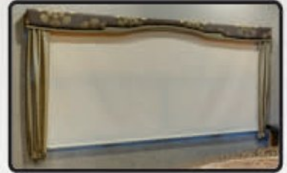
UPGRADE BLACKOUT ROLLER SHADES THROUGHOUT