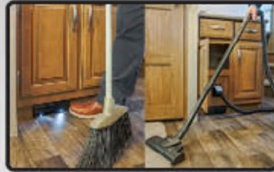
CENTRAL VACUUM W/KITCHEN TOE KICK W/ BOTH INTERIOR & EXTERIOR HOSE PORTS