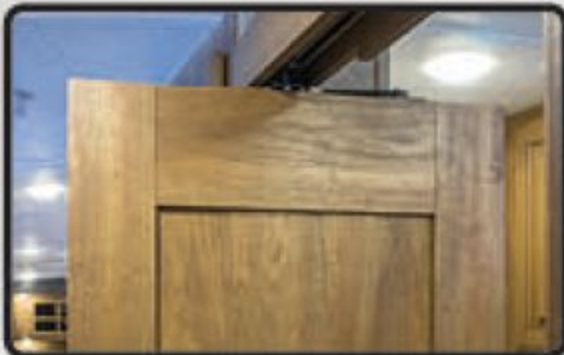
CLEVER SPACE SAVING PIVOT HINGE BATH DOOR