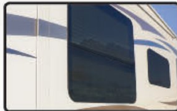
UPGRADE FRAMELESS WINDOWS