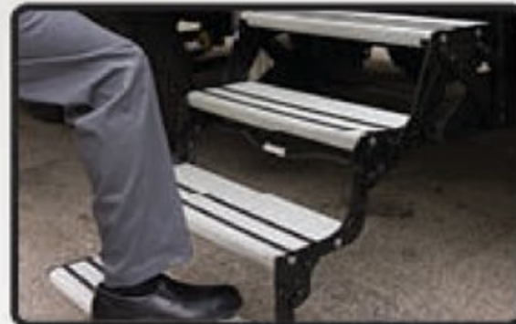
FOUR STEP ALUMINUM STEP TREADS FOR CONVENIENCE/COMFORT