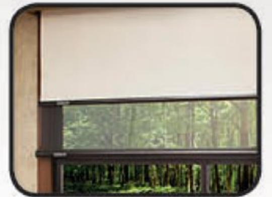
UPGRADE DAY/NIGHT ROLLER SHADES