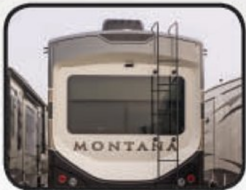
DECORATIVE FIBERGLASS REAR CAP (N/A 3790, 3791)