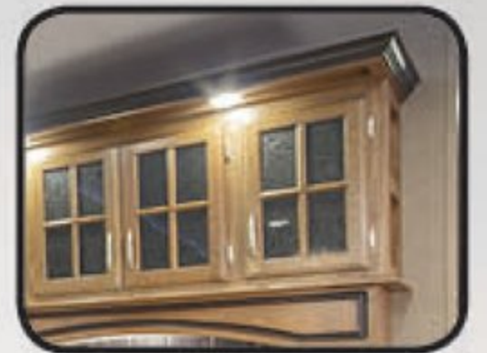
HARDWOOD CHERRY CABINET FRAMING (STILES)