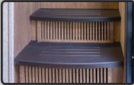
HARD SURFACE INTERIOR STEPS